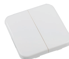
RTS33-ACC-01-xxP 2x ON/OFF