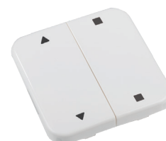
RTS33-ACC-03-xxP 1x UP/STOP/DOWN