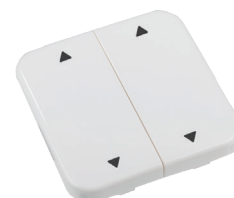
RTS33-ACC-02-xxP 2x UP/DOWN